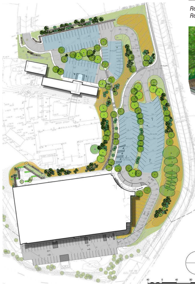
Site plan with porous parking, meadows, native shrubs and trees.