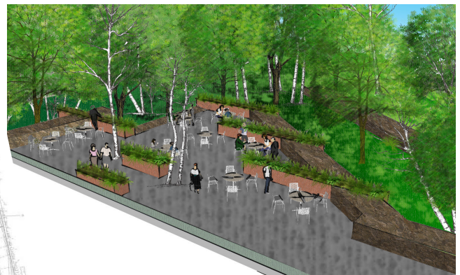
Rendering of Senior's Terrace with seating and plant beds for gardening.