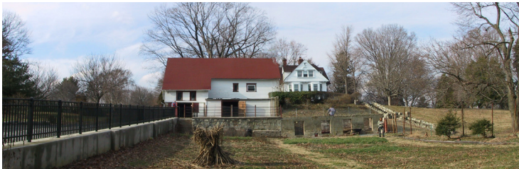
The design maintains the historic barn and relocates the mission-important veggie garden into a site feature.

The plan calls for a “three building” scheme of structures similar in scale to existing buildings: a Conference Center (the existing barn plus an addition); a Bedroom Building and a tiny Chapel. The Conference Center and Bedrooms are sited to form a new terrace. They overlook the vegetable garden. The Chapel, slightly removed from the other buildings, is sited to take advantage