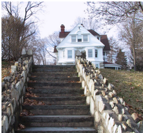
Steps adjacent to the barn with main house beyond.