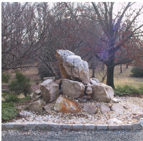
Lenape Rocks will be reorganized into a council ring amphitheater.