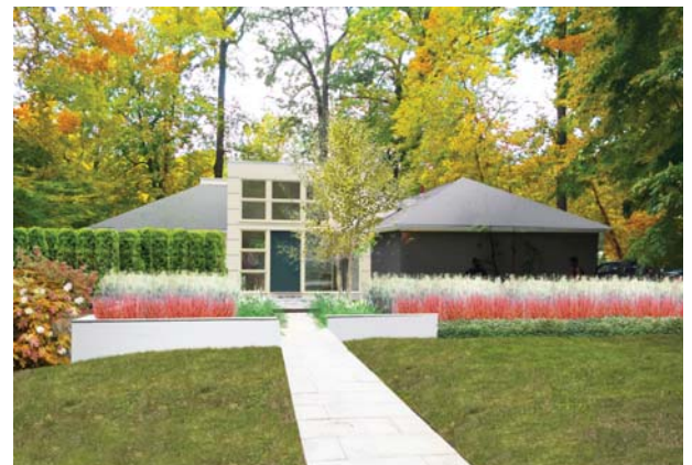
Front Entrance Fall/Winter Concept