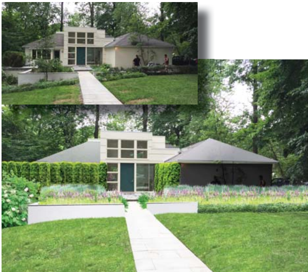
Front Entrance Summer Concept

At the rear terrace Viridian extended the lower-level living space to the outside by creating sleek and modern spaces through the use of Cor-ten steel, plank pavers and steel cable railing. A laser cut Cor-ten steel panel provides privacy from the neighbors while serving the dual role of extending the owner's art collection to the outside. The terrace captures the magnificent views while maintaining the mature and stunning hardwood trees that dance down the hillside. It's a perfect spot for the occasional dip in the hot tub under the stars, an al fresco dinner for two near the elegant fire pit, or larger gatherings of friends and family.