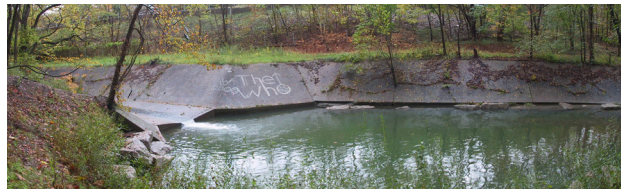
The existing channelized and polluted 9 Mile Run.