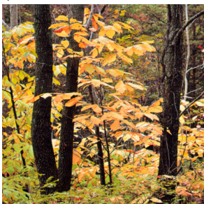
A diverse forest structure serves as a model for restoration.

Below: A schematic plan and project approach evolved from project team meetings.