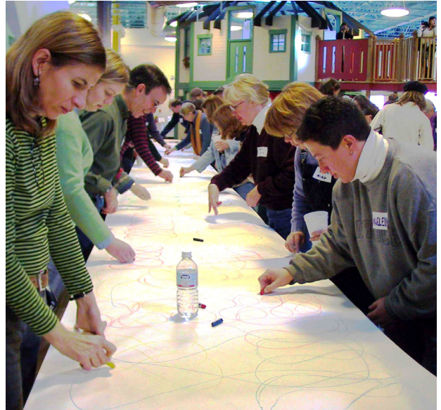
Participants at the 10 June 2006 charette help design the project.

The team developed an integrated park plan including water play elements, sustainable stormwater management, trail connections, stream bank stabilization and habitat restoration. The new landscapes restore habitats while cleaning and managing excess rain and snowmelt, a problem that currently wreaks havoc on Nine Mile Run by eroding streambanks and flooding it with pollutants. Viridian Landscape Studio brings its expertise in site restoration to the Regent Square Gateway Project.