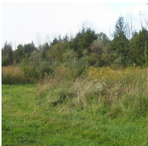
Existing meadow behind visitors center to be maintained and enhanced.

The Stony Brook-Millstone Watershed Association (SBMWA) encompasses a 265 square mile region of central NJ. As NJ's oldest environmental organization, SBMWA is dedicated to improving water quality, supporting proactive planning for watershed protection, and demonstrating alternative land stewardship methods. In 2008, SBMWA hired Viridian Landscape Studio in partnership with FMG Architects to design a site & alternative landscape for the new Visitors Center proposed on the 5 acre Buttinger Nature Center site set within its 860-acre preserve. Viridian's goal: introduce visitors to the story of the watershed and Preserve. By transforming lawn to meadow and utilizing raingardens, bio-swales and regionally native vegetation, the restorative landscape celebrates our human relationship to water and the restoration of the Hydrologic Cycle – the marriage of soils, water and vegetation. The design also challenges the notion of traditional landscape by providing alternative approaches to land management easily transferable to both institutional & residential landscapes.