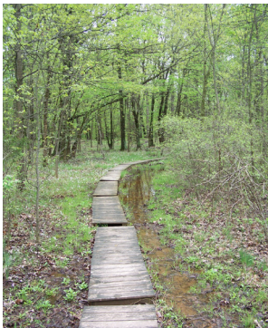
One of the many trails in need of stabilization

The Stony Brook-Millstone Watershed Association (SBMWA) encompasses a 265 square mile region of central NJ. As NJ's oldest environmental organization, SBMWA is dedicated to improving water quality, supporting proactive planning for watershed protection, and demonstrating alternative land stewardship methods. In 2008, SBMWA hired Viridian Landscape Studio in partnership with FMG Architects to design a site & alternative landscape for the new Visitors Center proposed on the 5 acre Buttinger Nature Center site set within its 860-acre preserve. Viridian's goal: introduce visitors to the story of the watershed and Preserve. By transforming lawn to meadow and utilizing raingardens, bio-swales and regionally native vegetation, the restorative landscape celebrates our human relationship to water and the restoration of the Hydrologic Cycle – the marriage of soils, water and vegetation. The design also challenges the notion of traditional landscape by providing alternative approaches to land management easily transferable to both institutional & residential landscapes.