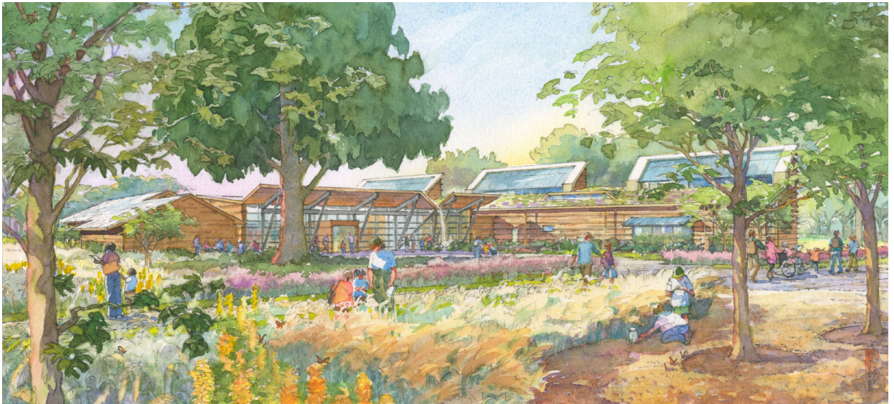
Rendering of the Stony Brook-Millstone Watershed Association Visitors Center with forecourt meadows, rain gardens and green roof (image courtesy of FMG architects).

Location: Pennington, New Jersey Client: Stony Brook Millstone Watershed Association Size: 5 acres Cost: $900,000 in sitework Status: CD's completed in 2011, Currently in Bidding