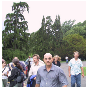
Arboretum committee and the design team

Viridian recommended phasing for the plan components and was retained to develop a phase one pilot project: the waterway restoration and site work for the Mollie Dodd Anderson Library which was completed in 2009.