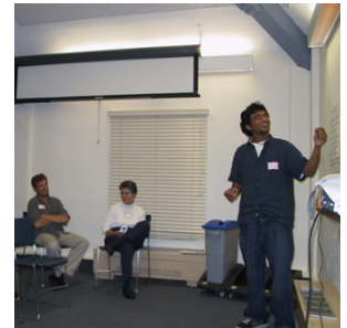
A student presents his team's ideas