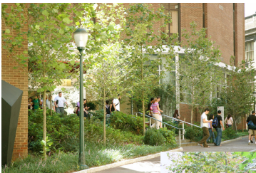
The transformed courtyard where the accessible path is just as enjoyable and beautiful to traverse as the stairway.