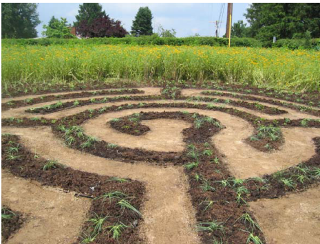
Installation of Labyrinth

The 73-acre site is home to a convent and school, constructed in the 1930s. The building renovation, designed by Perkins Eastman, Architects, requires new handicapped-accessible entrances and clarification of the site's vehicular circulation and parking. The building and site demonstrate sustainable design and received LEED Gold certification.