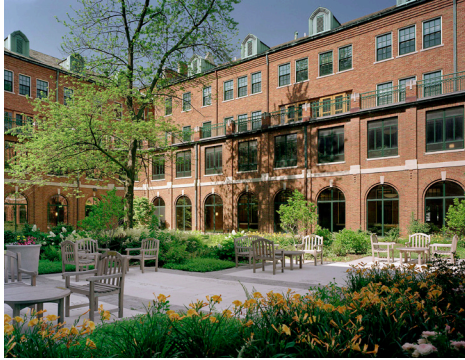
Gathering Spaces in Motherhouse Courtyards

Together with Susan Maxman & Partners, Architects, Viridian Landscape Studio worked to create an ecologically sound development plan that would sustain the religious order, promote spirituality, and maintain the ecological health of the 280-acre campus. The Sisters envisioned a master plan and site improvements that made tangible their philosophy of living sustainably. The ambitious program for the campus separated vehicular and pedestrian circulation, converted lawns to sustainable meadows, integrated stormwater management with wet meadows and swales, demonstrated natural graywater treatment with a constructed wetland, preserved rare oak savannah habitat, cultivated organic gardens and created contemplative spaces and Alzheimer's Court. In 2006 the project was LEED certified and was selected by the American Institute of Architects (AIA) Committee on the Environment (COTE) as one of its Top 10 Green Projects.