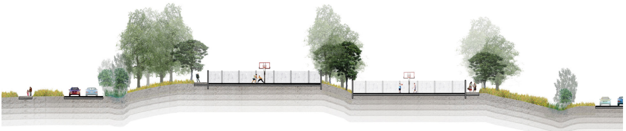
Section through basketball courts, park drive, and wet meadow swales