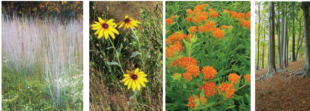
Native grasses, flowers and trees provide variety and beauty.

The design allows for visibility of the mural while providing a mix of ecological diversity in three native north eastern habitats; young woodland, dry open meadow, and lowland rain garden. A young woodland composed of varying sizes of American beech trees, successionaly bleeds into a dry open meadow, recalling the open fields that historically accompany edge habitats. The lowland rain garden captures rainwater from adjacent row homes, celebrating water while providing educational opportunities on sustainable stormwater management. A mix of native plants - little bluestem, purple love grass, coneflower, cardinal flower, and milkweed - provide habitat for a diversity of wildlife, limit maintenance worries, and offer year-round beauty to the site.