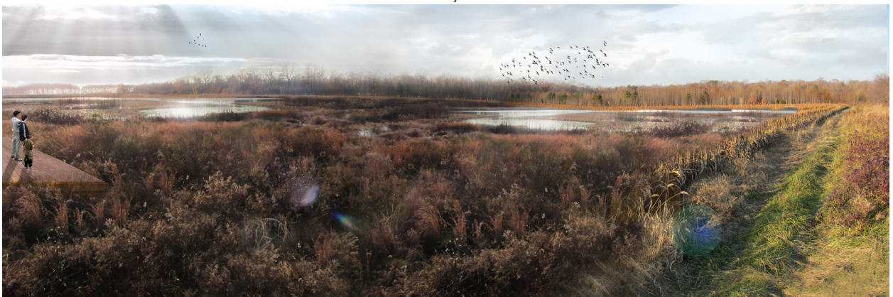
Project: Wetland habitat creation