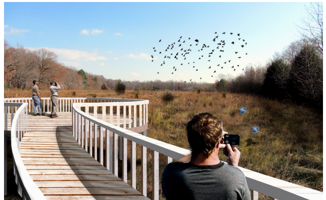
Project: Shrubland Wetland Trail