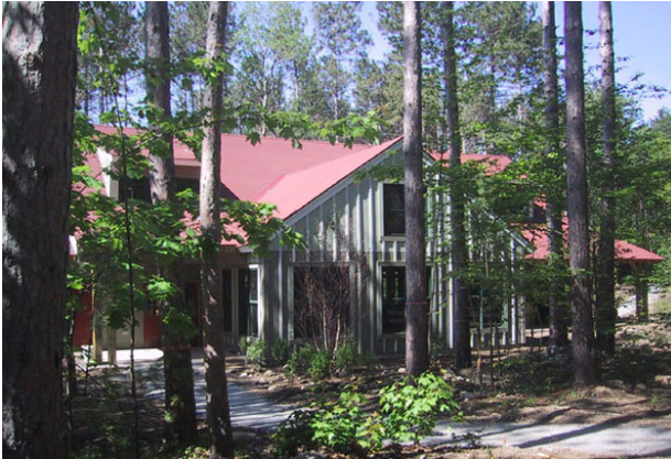
New Conference Center and Camp Lodge is sited within the existing pine forest.

Location: Greenfield, New Hampshire Client: Episcopal Diocese of Massachusetts Size: 326 acres Cost: $1.8 million Status: Design and documentation completed 2002