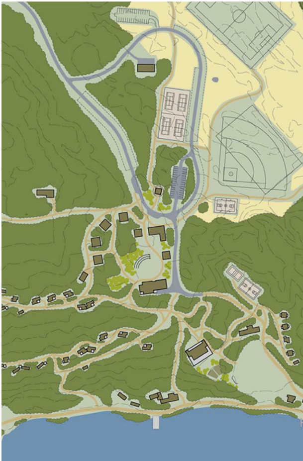
Illustrative Site Master Plan

The Episcopal Diocese of Massachusetts, comprising the urban Boston communities as well its suburbs, wanted to provide a summer camping experience that would serve some 1,500 young people, a year-round conference facility to meet the needs of adults and youths, and an inviting and community-building environment for family camping. The new camp and conference center is sited on a wooded 326-acre site bordering Otter Lake. The main core of buildings are winterized and function as a conference center in the off season. Building siting and trail alignments will also allow much of the camp to be handicapped accessible.