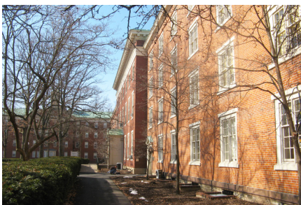
Existing condition photos