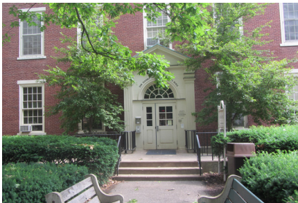
Existing condition of entry