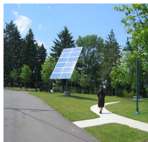
Photo voltaic array