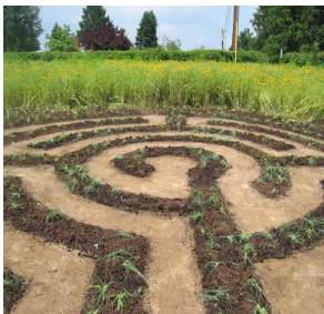
Installation of Labyrinth