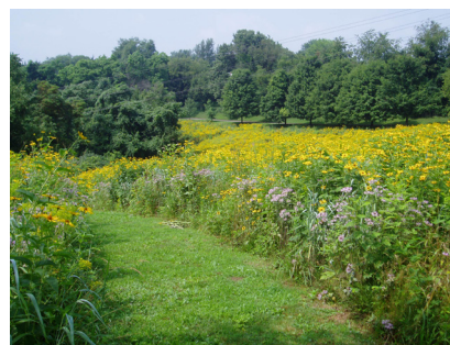
Established meadow with mown path