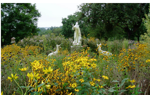
St. Francis of Assisi in meadow plantings