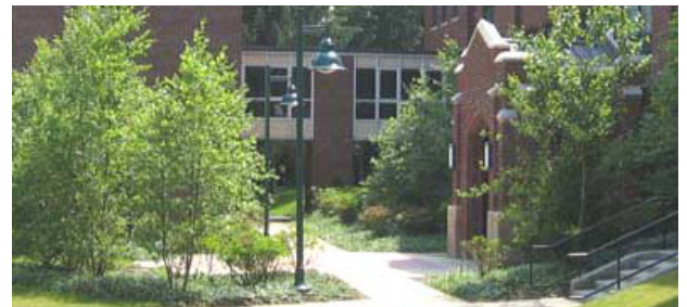
Intimate School & Convent Courtyard Entrances are multipurpose gathering spaces.