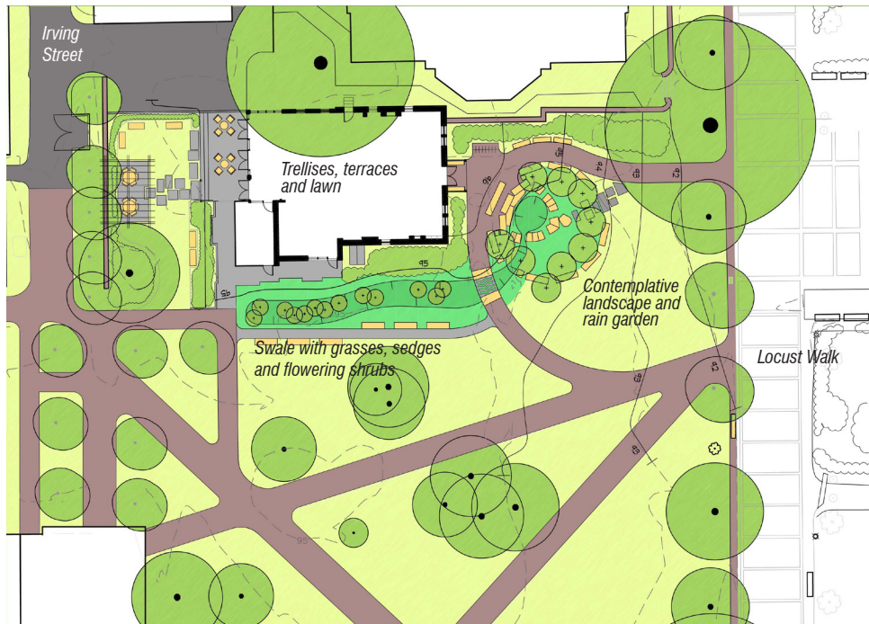
Schematic Landscape & Site Plan for Civic House