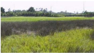
Tidal marshes, Noisette Preserve.