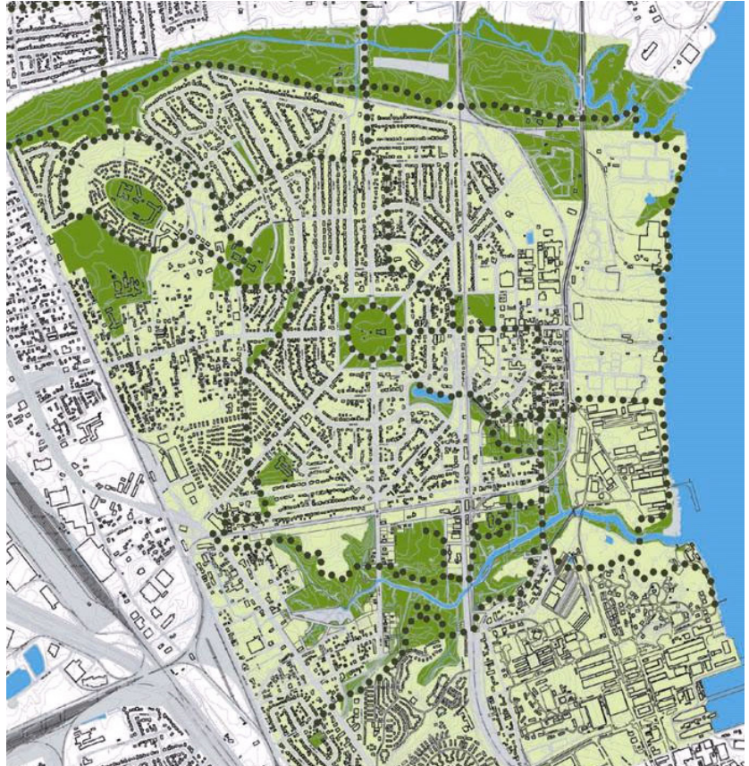
Plan of the Open Space System for 2,800 acres, which includes Parks & Greenways throughout the community; protection strategies for sensitive habitats & existing trees within the urban landscape; innovative stormwater management strategies that integrate wooded stream corridors with multi-use pathways; and preserve and restore tidal wetlands & forested lowlands.