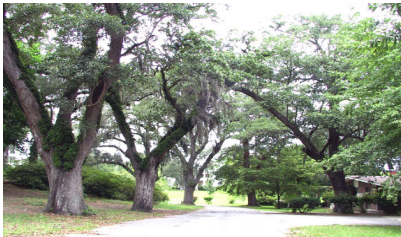
Historic Navy Yard landscapes will become part of the open space system along the Cooper River.