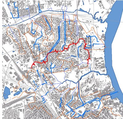
Watersheds and drainageways, c. 1990, shows the extent of streams that have been piped or ditched. Some piped streams will be daylighted in the marsh restoration plan.