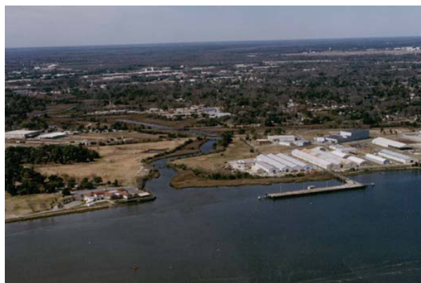
Aerial view of Noisette Creek and waterfront along the Cooper River

Viridian Landscape Studio worked as environmental consultants on the master planning team for a 2,800-acre area of North Charleston. The project is named “Noisette” for famed French botanist Phillippe Noisette, whose name also graces a saltwater marsh and creek that runs through the heart of the area. The project encompasses a three-quarter mile waterfront park at a former Naval Base on the Cooper River and a connecting urban park surrounding Noisette Creek, with greenway connections into the community, which will include 7,000 new housing units, 3,000 rehabilitated housing units, and 6 to 8 million square feet of commercial and retail space.