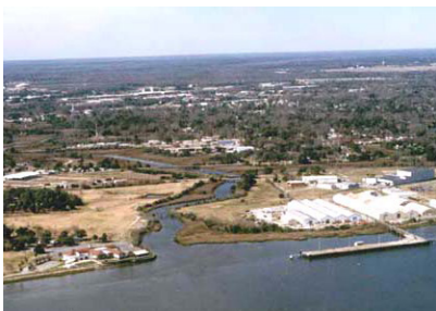
The mouth of Noisette Creek along the Cooper River will be the site of tidal marsh restoration and a new Cooper River park.