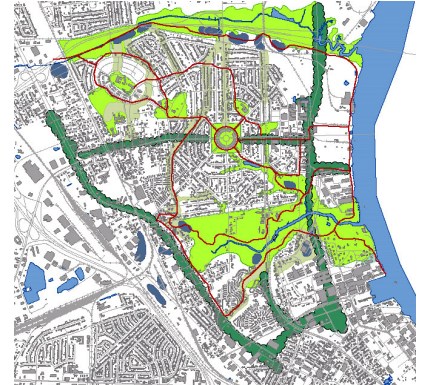
Green Infrastructure concept plan shows the two preserves for Filbin Creek and Noisette Creek, with multi-use paths connecting these preserves to community parks, schools and neighborhoods.