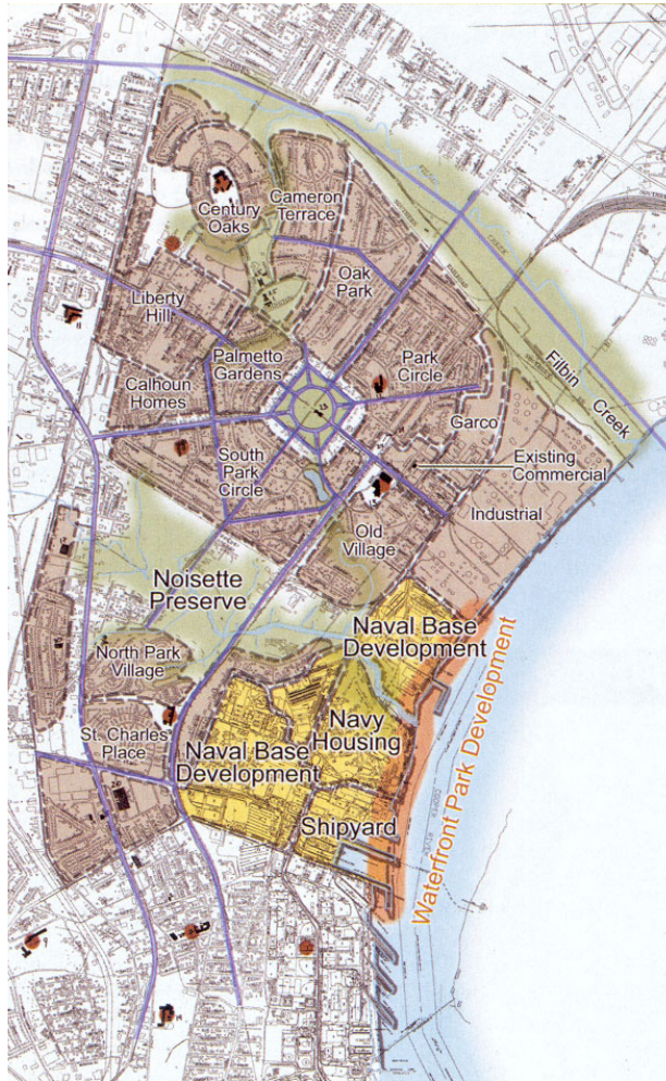
Concept Plan for Noisette Project

Status: Initial waterfront project complete, remaining projects underway in phases