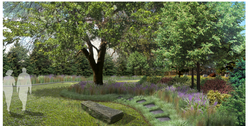
New Cemetery Landscape - Woodlands Memorial Gardens: A series of garden rooms for meditation and reflection and accommodates a range of interment options.