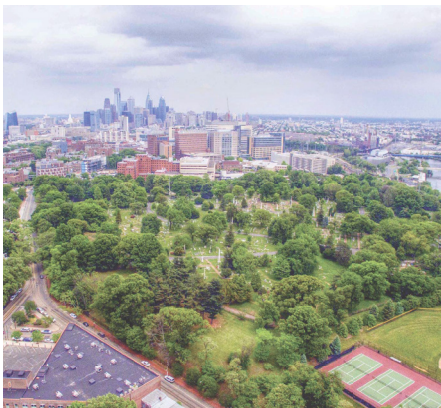
Aerial view of the Woodlands looking northeast