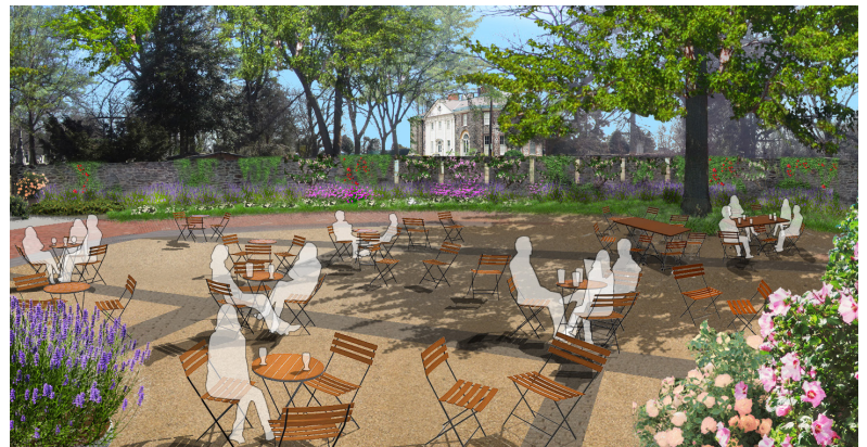
The Carriage Shed Event Space: Reuse of the Carriage Shed will create a picturesque setting within the Historic Core that has ample room for large 300+ programs and events, either tented or open-air.