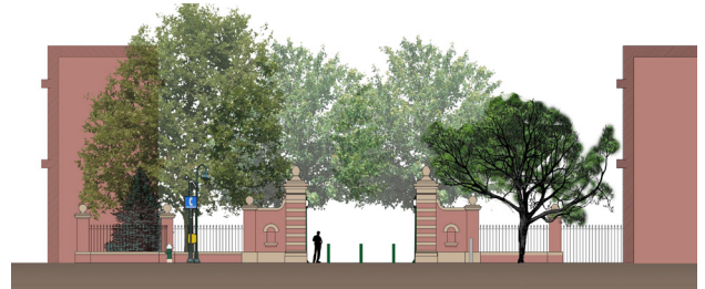
Rendering of the improvements to the Class of 1873 Memorial Gateway

Viridian was hired to develop a schematic design for University of Pennsylvania's Hamilton Walk. Hamilton walk, formerly Pine Street, is now a major campus thoroughfare adjacent to dormitories and the medical science buildings on campus. The existing walk is primarily asphalt with steel edging, widened over the years resulting in a patchy and informal appearance. The walk currently boasts a mature tree canopy yet the landscape has no unifying feel. A complex underground network of utilities makes any intervention a challenge.